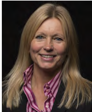
Chief Executive The Racing Foundation

The Racing Foundation's purpose is to work in partnership with the racing industry to ensure a sustainable future for our sport. This includes a commitment to helping develop understanding and action around the key issues we face and to enable a collaborative and strategic response.